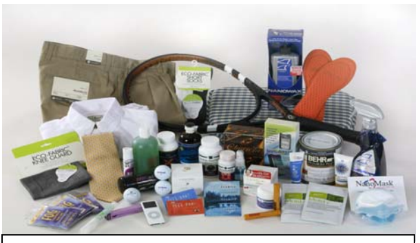
A selection of nanotechnology consumer products